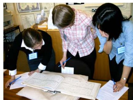
Librarians try their hand at family history

Few of the guests had visited an archive before. They expressed enthusiasm at having the opportunity to learn more about the services that they often refer library and museum customers to but have not experienced themselves. In particular, they highlighted the insight they had into family history and making the most of online resources. At