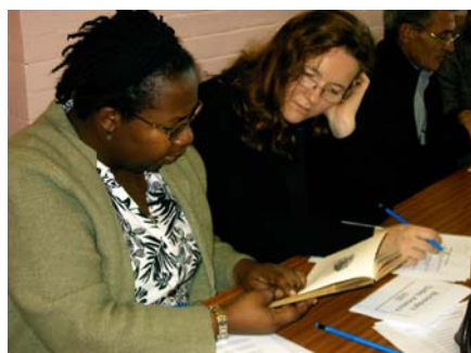
Searching for answers to the local history research activity at DALHS

This type of event is essential as libraries are often the first port of call for those wanting to start tracing their ancestry. Training, such as this, increases library and museum staffs' confidence to help the public on their journey into their family's past.